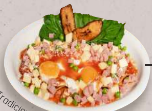
Tradicional tomate sauce