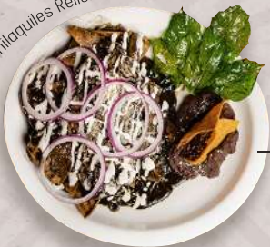
Chilaquiles Relleno Negro Sauce

Served with refried beans and tortillas.