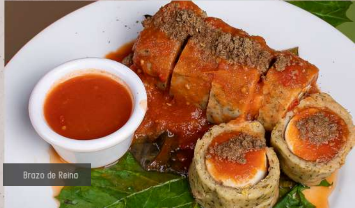
Brazo de Reina

A rolled tamale made of roasted pumpkin seeds, hard-boiled eggs, and wrapped in cornmeal and Chaya dough. This dish is steamed in banana leaves and served with tomato sauce.